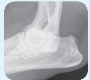
X-ray of a normal elbow joint

Radiography is commonly used to investigate joint problems.